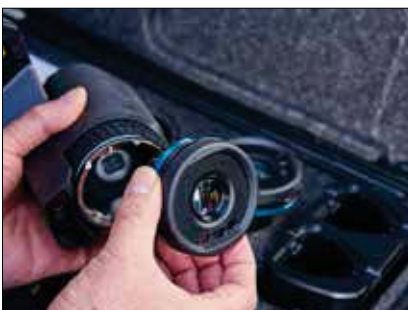
Share lenses (wide angle to telephoto) across your fleet of cameras thanks to AutoCal™ optics