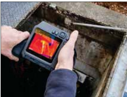
180° rotating optical block and bright 4" LCD make the T500-Series easy to use in any environment